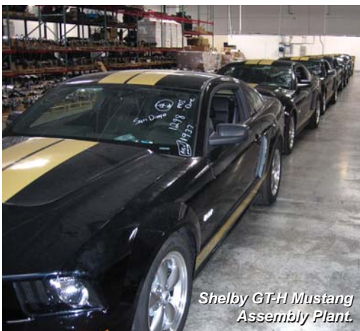
Shelby GT-H Mustang Assembly Plant.

Back in the 60's, the legendary Carroll Shelby and Hertz decided to produce special-edition Shelby Mustangs for rental customers who were real car enthusiasts. Ford supplied the new Mustangs with V-8 engines and automatic transmissions, and Shelby added extra performance and style, giving the public a unique driving experience — dubbed "Rent-A-Racer". Now, the