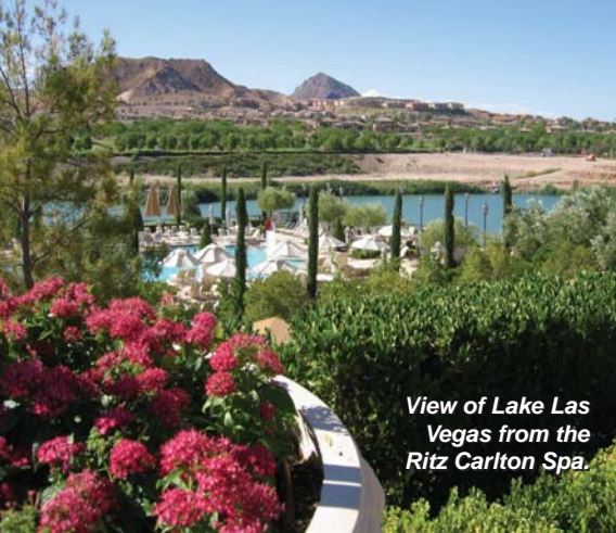
View of Lake Las Vegas from the Ritz Carlton Spa.