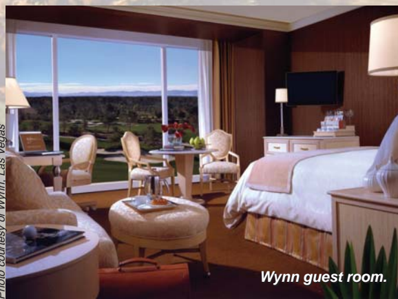
Wynn guest room.

We took the Shelby out for a 30 minute drive to Lake Las Vegas. The car comes equipped with SIRIUS Satellite Radio, so we were entertained the whole way with a comedy channel. In our real world, we drive a mini van — practical, but arguably the most uncool of all cars — so driving this very sporty and unique car was a real change of pace. The last time anyone checked either of us out at a light was 1969, so it was a strange (but kinda cool) feeling being ogled. Only this time, it definitely wasn’t us, it was the car.