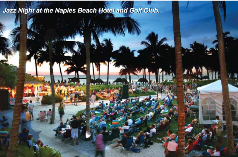
Jazz Night at the Naples Beach Hotel and Golf Club.

For more shopping and dining opportunities, hotel guests can peruse the trendy shops and restaurants on nearby 5th Avenue, historic 3rd Street, Waterside and more in downtown Naples. We had lunch at Campiello Ristorante on 3rd St., which we found to have a Tuscan-style charm and delectable food. The Dock at Crayton Cove is a rustic open-air Waterside restaurant that proved to have tasty food, and a big friendly crowd. Downtown