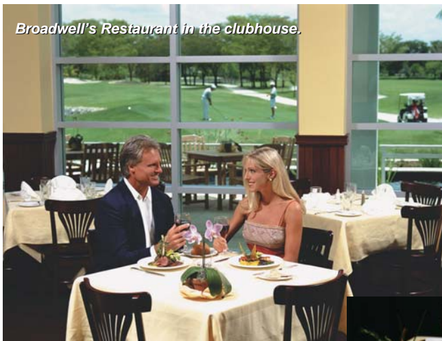
Broadwell's Restaurant in the clubhouse.

a main attraction, as is the serenity that surrounds it. For seven miles to the south of the hotel are private homes, and to the north are low rise condos, as there are height restrictions along the beach.