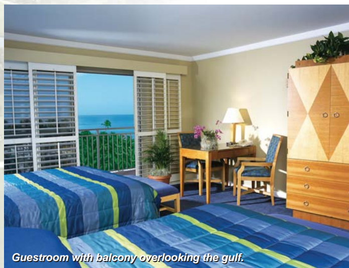
Guestroom with balcony overlooking the gulf.