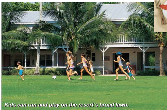
Kids can run and play on the resort's broad lawn.

minded, the resort holds free outdoor monthly jazz nights, and brings in name entertainment. It was raining on jazz night when we were there, yet still the people came. We managed to enjoy a beautiful sunset over the gulf during a break in the rain.