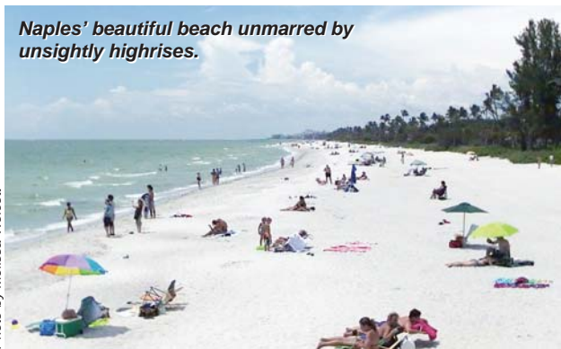
Naples' beautiful beach unmarred by unsightly highrises.

Across a two-lane road from the hotel is the resort's 18-hole PGA championship golf course, tennis center (with six Har-Tru courts), and three-story clubhouse. The building complements the Hotel's style, and houses a wonderful spa with nine treatment rooms (and a great staff, by the way), fitness center, ballroom and a fine restaurant called Broadwell's.