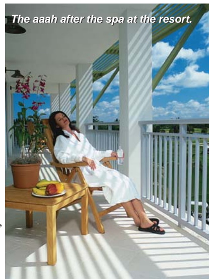
The aaah after the spa at the resort.

On a Naples Beach Hotel and Golf Club family vacation, Grandpa plays golf, Grandma goes to the spa, Dad plays tennis, Mom goes to the beach with the kids, and they all meet for dinner in HB's. The next day they switch activities, or do any, or all, of these things together. It's a win-win situation for everyone.