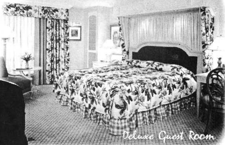
Deluxe Guest Room

A drive along the coast takes you past the landmark 1848 Lighthouse and a myriad of antebellum style homes, to Beauvoir, the last residence of Jefferson Davis. Public tours of the home are available, as well as a museum on